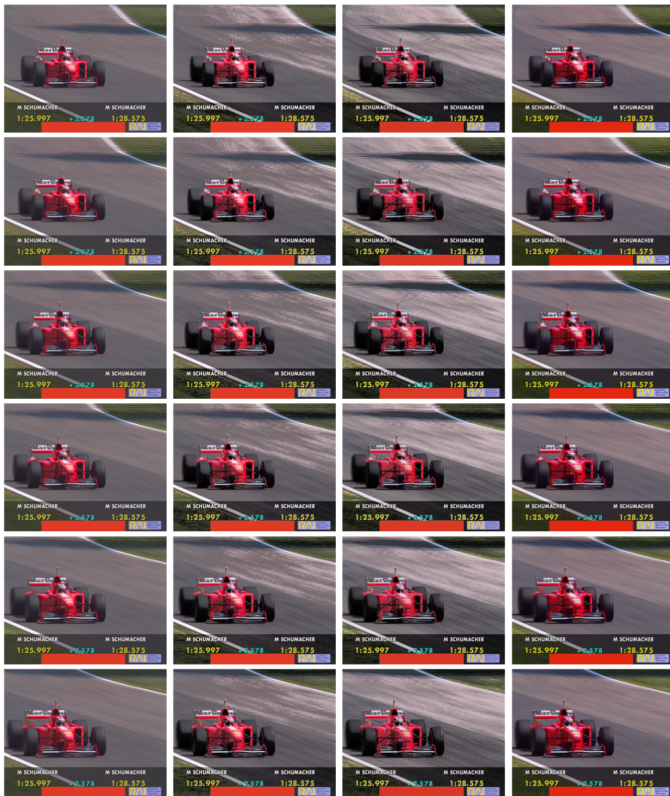
(a) Original image