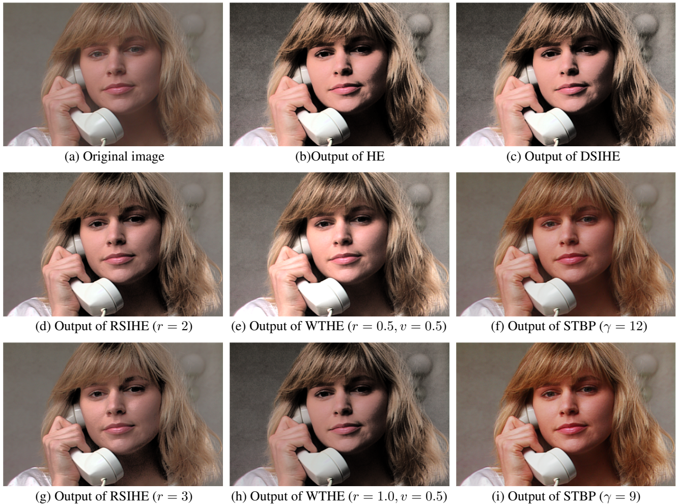
Fig. 2. The example of “Susie” and its various enhanced frames.

enhancement. Second, the S-shaped transfer function is supported by neurological study of human eyes. Experimental results on video sequences from VQEG Phase I test database demonstrate the superiority and simplicity of the proposed STBP algorithm as compare to HE, DSIHE, RSIHE, and WTHE methods.